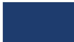
R=0 G=58 B=112